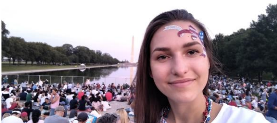
4th of July with Americans at the National