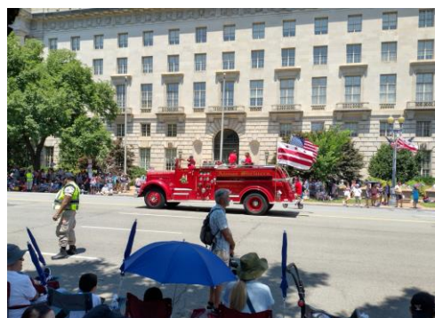
The 4th of July parade