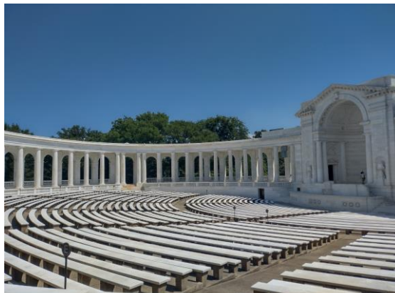
© Wuketich, Viktoria: The Arlington cemetery